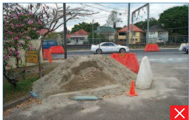
Stockpile not appropriately stored

If accidental spills or tracking of soil occur on hard surfaces such as concrete driveways, rumble pads and public roads then the cleaning methods described overleaf should be implemented prior to the end of the working day.